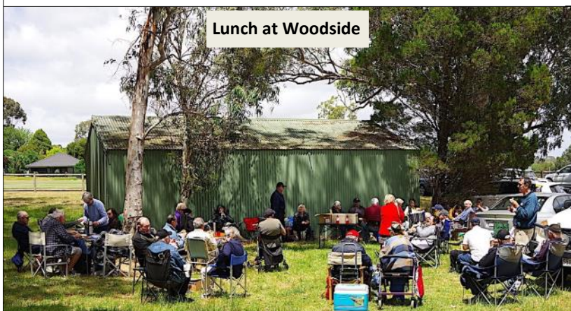
Lunch at Woodside