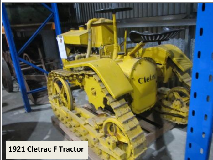
1921 Cletrac F Tractor