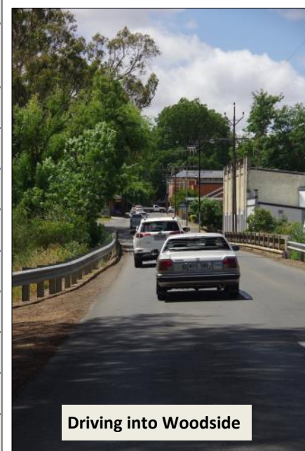
Driving into Woodside