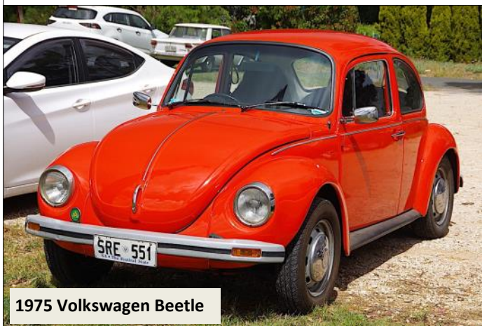
1975 Volkswagen Beetle