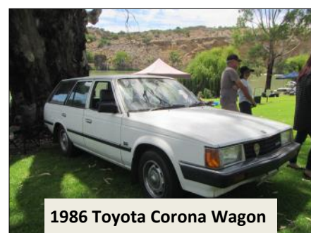
1986 Toyota Corona Wagon