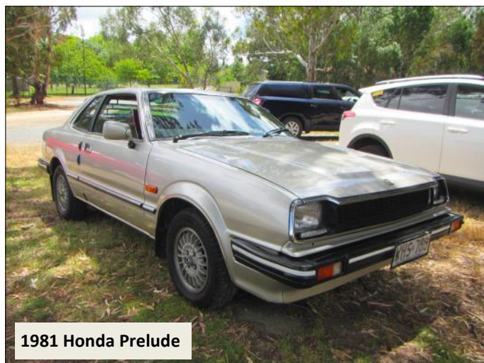
1981 Honda Prelude