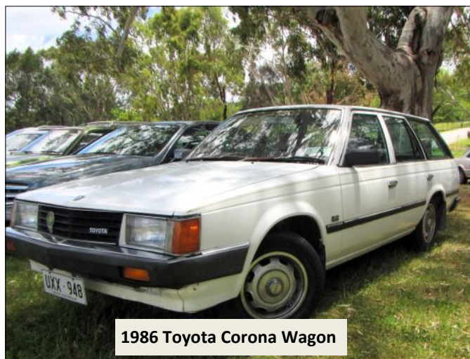
1986 Toyota Corona Wagon