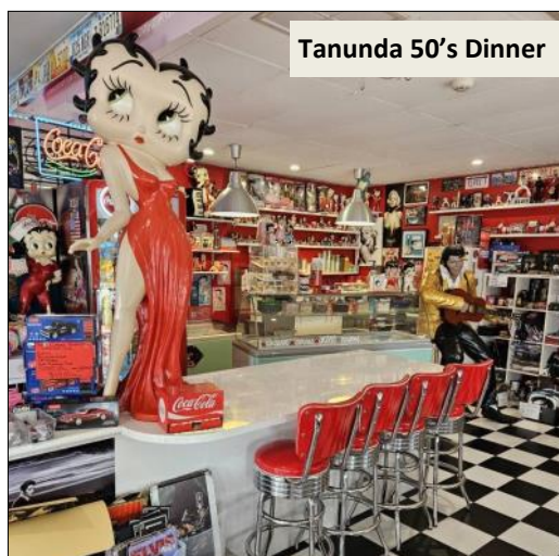
Tanunda 50's Dinner