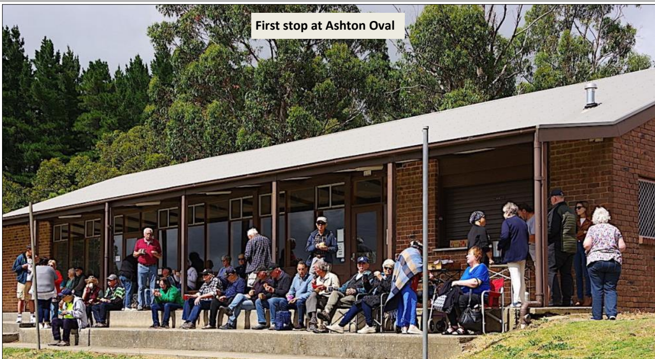
First stop at Ashton Oval