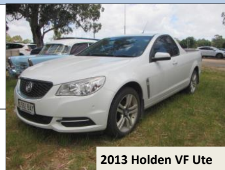
2013 Holden VF Ute