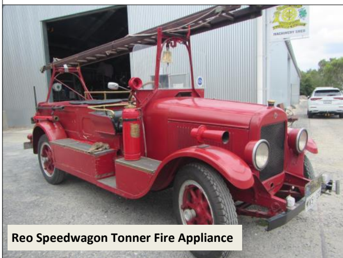
Reo Speedwagon Tonner Fire Appliance