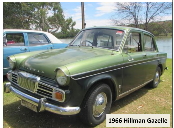
1966 Hillman Gazelle