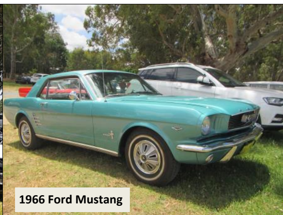
1966 Ford Mustang