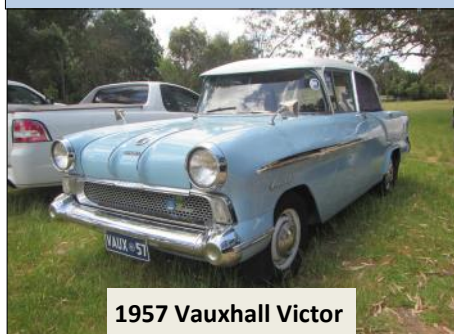
1957 Vauxhall Victor