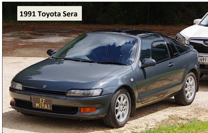
1991 Toyota Sera