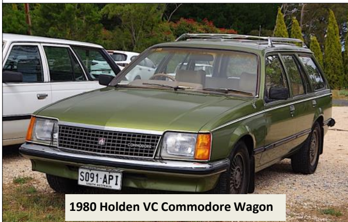
1980 Holden VC Commodore Wagon