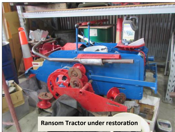
Ransom Tractor under restoration