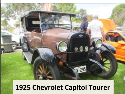
1925 Chevrolet Capitol Tourer