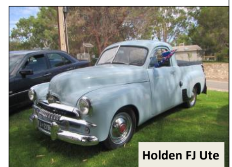
Holden FJ Ute