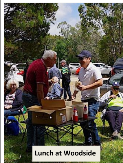
Lunch at Woodside