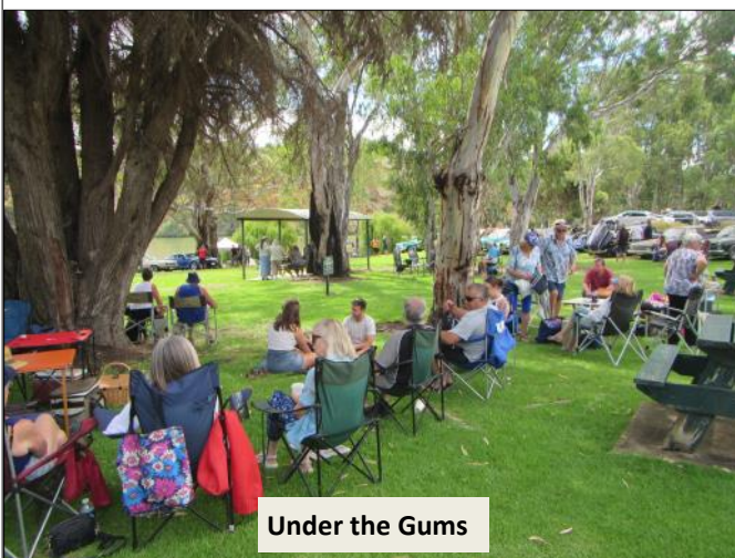
Under the Gums