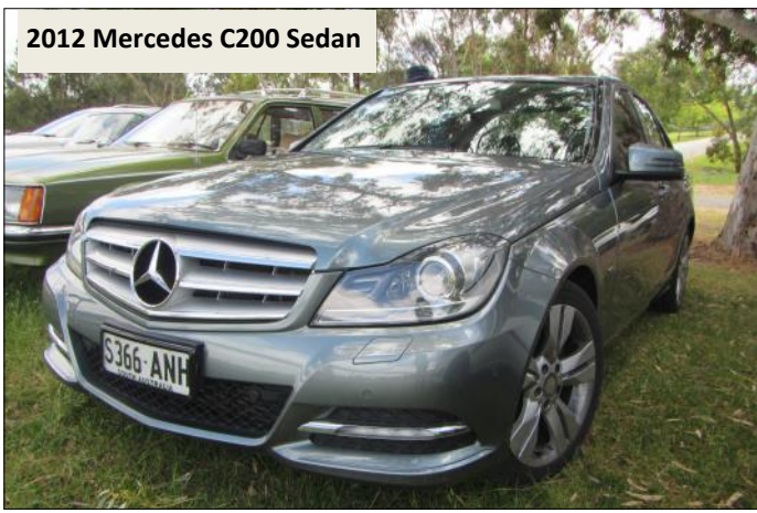
2012 Mercedes C200 Sedan