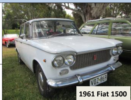
1961 Fiat 1500